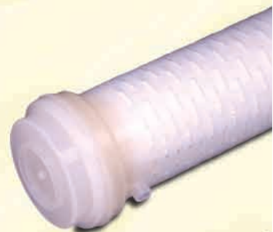
SOE Flat, Closed End

Minntech International Singapore Representative Office No. 138 Robinson Road #15-09/1C The Corporate Office Singapore 068906 Tel: +65 6227 9698 Fax: +65 6225 6846